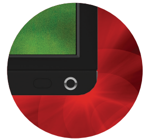
Modern Curved Corner Design in High-Gloss Black and Frame Stand

In a sea of large-screen television choices, the Toshiba 40" L1400U strikes the perfect balance—delivering great picture quality and value, with a slim modern design and elegant new frame stand. Energy efficient with an LED-backlit display, the 1080p Full HD 40" L1400U is equipped with Dynamic Picture Mode for maximum contrast, clarity and color saturation. The L1400U offers DTS TruSurround™ for immersive sound and clear dialog. Everything you need and nothing you don't, the 40" L1400U LED HDTV is the solid choice from a brand you can trust.