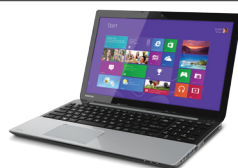
Satellite ® L55 Series Laptops