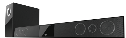
SBX4250 Sound Bar